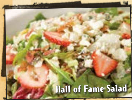
Hall of Fame Salad